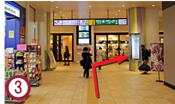
3 The Takasaki Station concourse is on the escalator on the far right of the front.