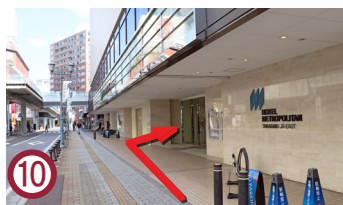
10 After about 30m, you will see the front entrance of Hotel Metropolitan Takasaki on your right. Please enter the entrance and take the elevator to the lobby reception on the 6th floor.