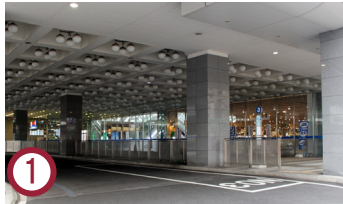
1 The bus stop is in front of Yamada Denki, the east exit of Takasaki Station.