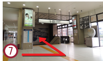
7 After 24:30. At the end of the west exit of the concourse, go down the stairs on your left and go outside once.