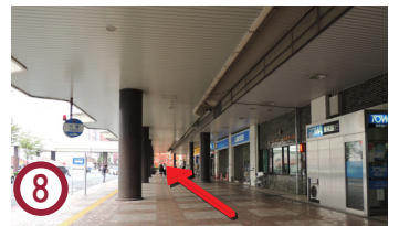
8 If you turn your right hand, you can see the convenience store. Please go straight to the Daruma mural in the back.