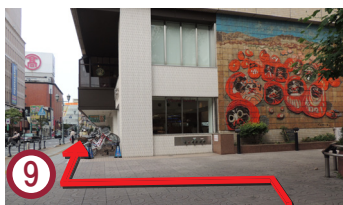
9 When you reach the Daruma mural, continue along the road along the building.