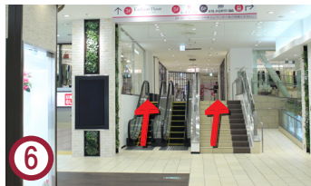
6 Go straight into "Monterey" and you will see an escalator and stairs in front of you (if you have a carry back, please use the escalator or slope). Go up and there is an elevator A behind the clothing store on your right, so please go up to the hotel lobby / front desk on the 6th floor. (This elevator will operate until 24:30)