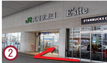
2 Enter from the east exit of JR Takasaki Station next to Starbucks.