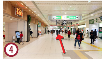
4 Follow the concourse toward the west exit on the left side (in the back of the image).